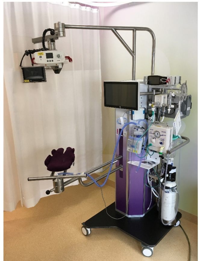
Figure 1 The Concord, a new specially designed resuscitation table, including the platform for the infant, which can be turned above the mother's pelvis. The table is fully equipped to provide complete standard care and has a built-in respiratory function monitor.

A new custom-designed resuscitation table (the Concord, figure 1 ) was used to provide full standard of care for stabilisation of preterm infants at birth with an intact umbilical cord. The Concord is a mobile device, of which the platform can be adjusted to be positioned in very close proximity to the birth canal without stretching the umbilical cord. The platform contains a slit through which the umbilical cord can be placed. The table is provided with the same equipment for resuscitation as used in our standard resuscitation table, being a T-piece ventilator, radiant warmer, suctioning device,